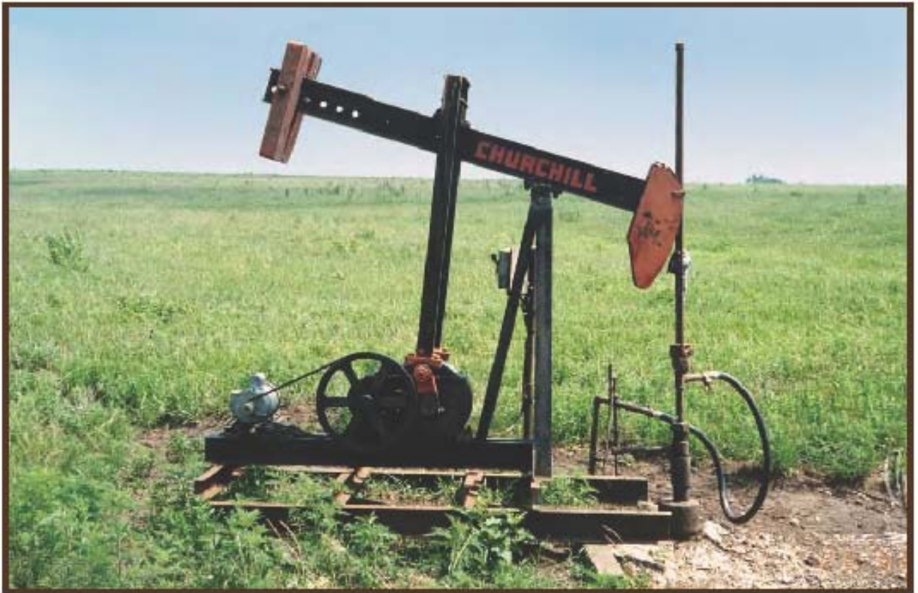
Cass County Well